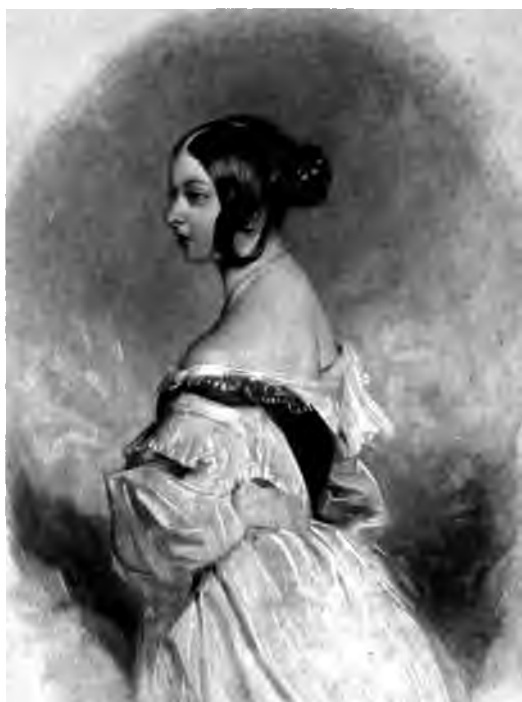
Queen Victoria at the age of twenty from the original sketch by the Queen's Landscaper at Windsor Castle